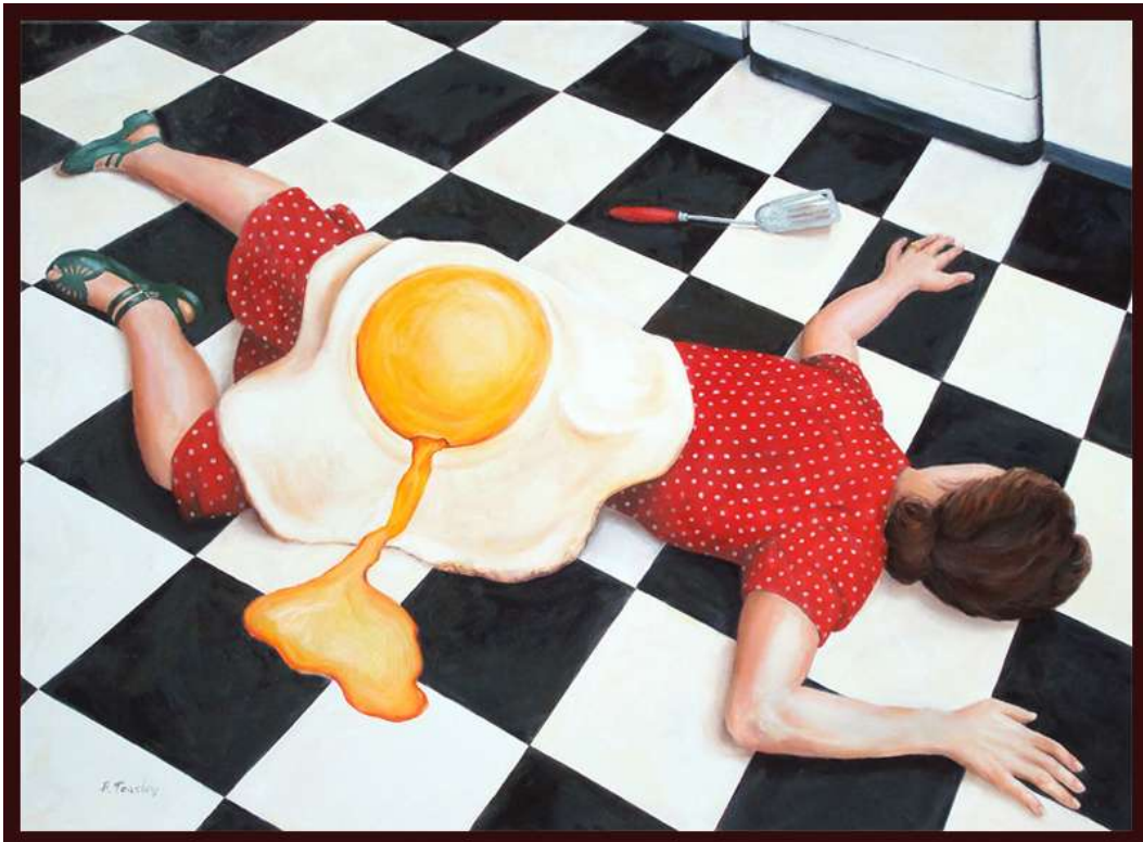
Barbee Teasley, Peggy Losses the Fight Oil, 30x40", 2008