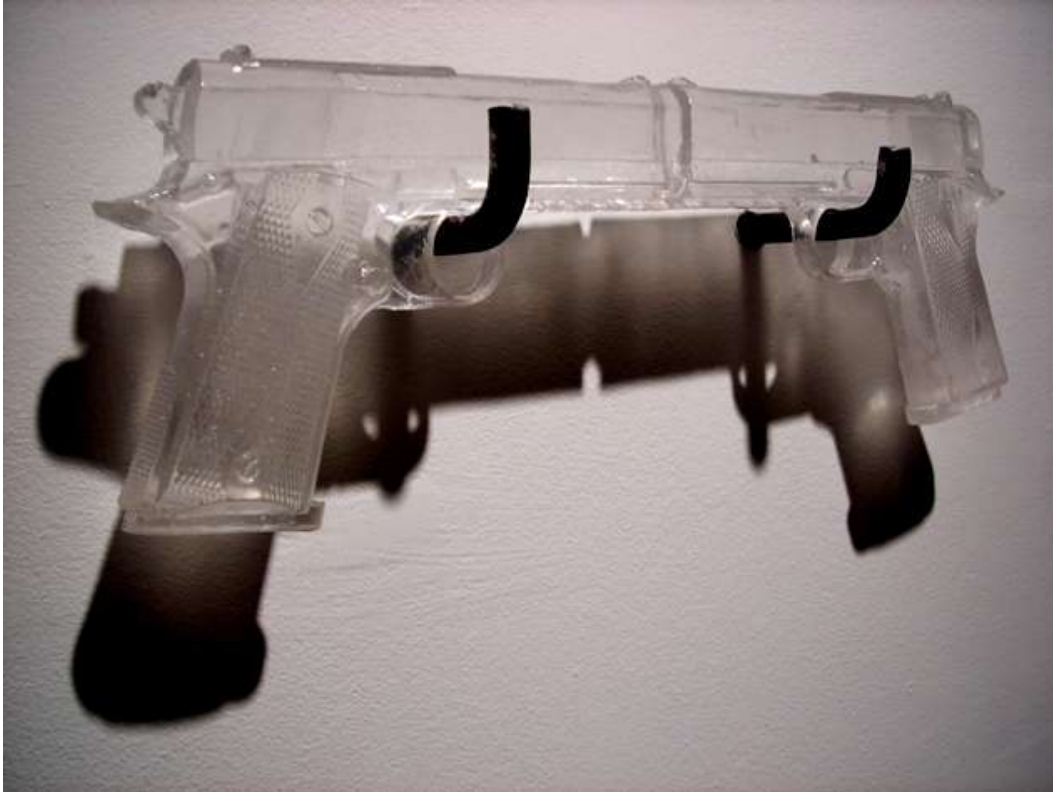
Michelle Acuff, Untitled , 7x14x2", cast glass, steel, 2008.

Across the Divide: Contemporary Art from the Scablands and Beyond Center on Contemporary Art 2009