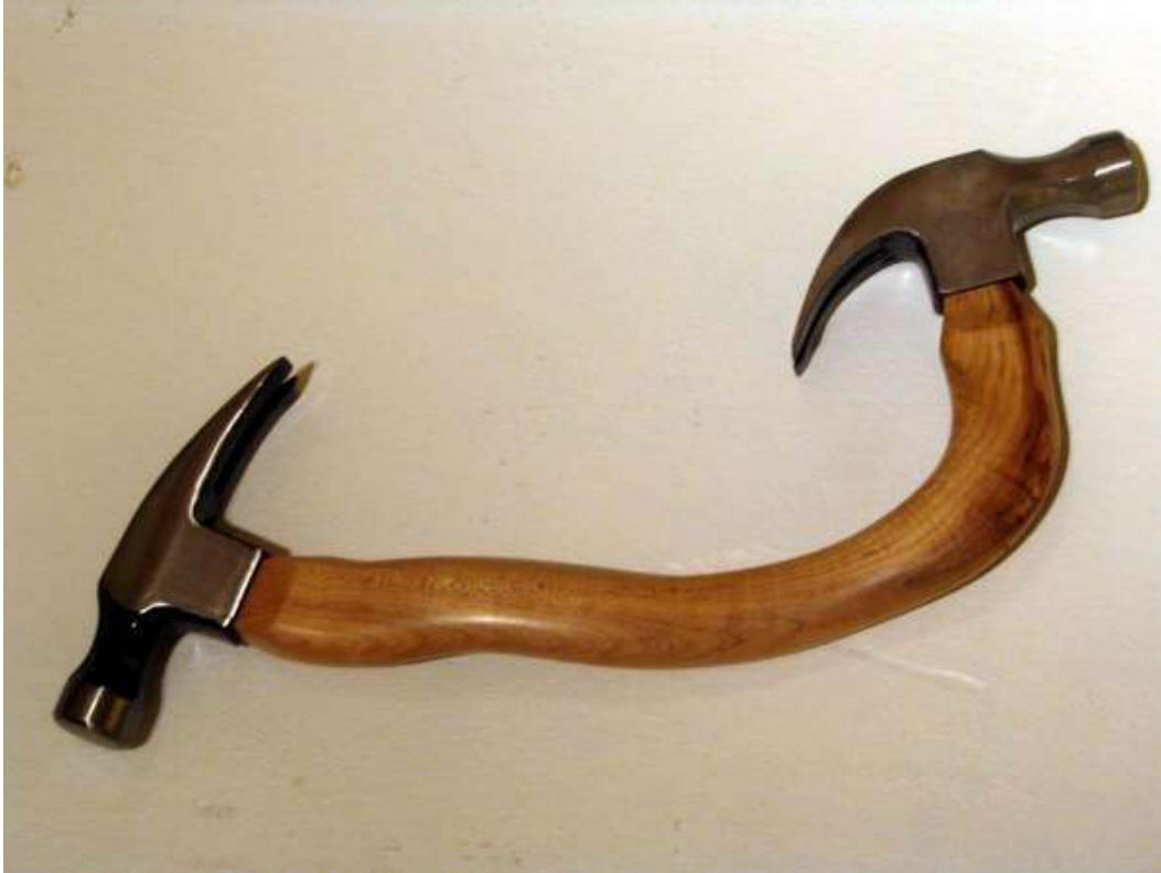
Mark Scherer, DUO 15" X 6" X 2" - maple with hammer heads - 2009

Across the Divide: Contemporary Art from the Scablands and Beyond Center on Contemporary Art 2009