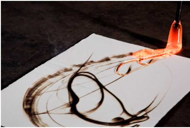
Glass Pyrograph working shot